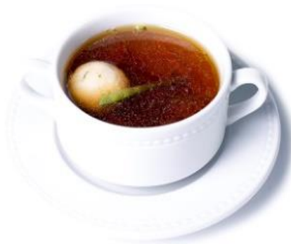
Broth made of chicken with vegetables cooked in it and noodles