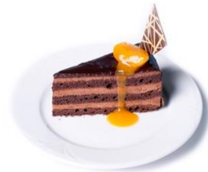
Sacher cake with apricot

The cost of the recommended menu: 32 € / person