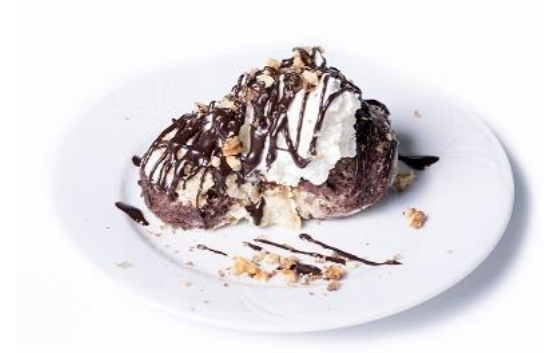
Somlói sponge cake

The cost of the recommended menu: 28 € / person