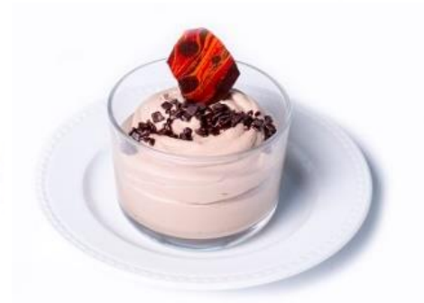
Chocolate cup cake

The cost of the recommended menu: 30 € / person