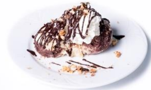
Somlói sponge cake

The cost of the recommended menu: 28 € / person