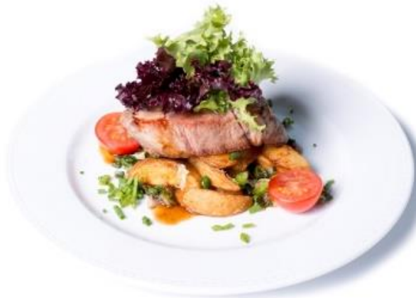
Grilled pork chuck steak with spring onion jacket potato