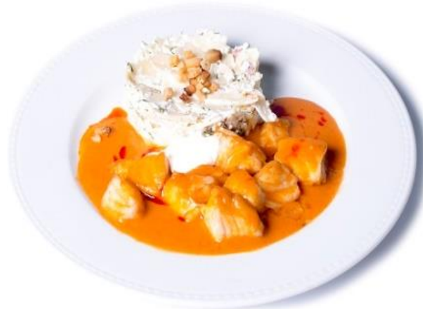
Cat-fish goulash with savory curd pasta and roasted bacon