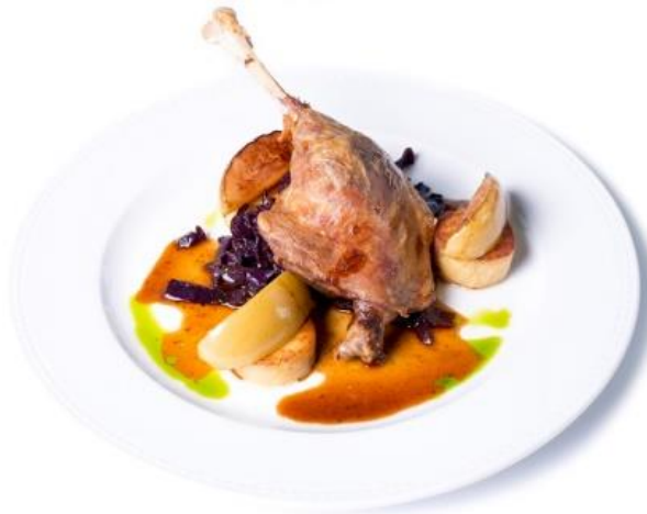
Crispey duck leg with steamed cabbage and potato dumplings