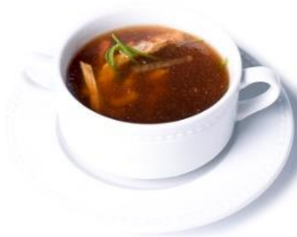
Broth made of beef with crispy vegetables and dumplings