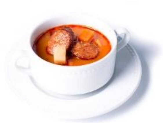
Hungarian-style potato soup with goose sausages