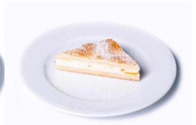
Peach-cottage cheese pie

The cost of the recommended menu: 28 € / person