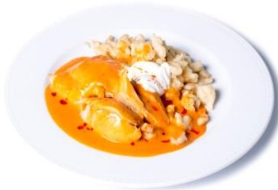
Chicken leg fillet paprikash with noodles