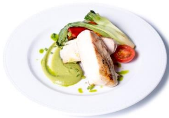
Grilled chicken breast fillet with roasted vegetables and fennel sauce