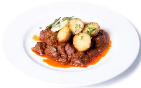
Beef stew with parsley potato