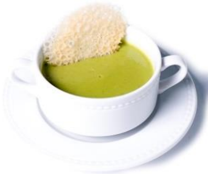
Green peas cream soup with crispy cheese