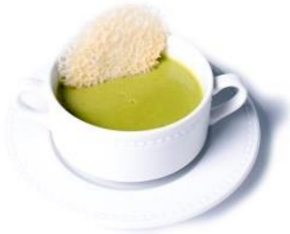
Green peas cream soup with crispy cheese