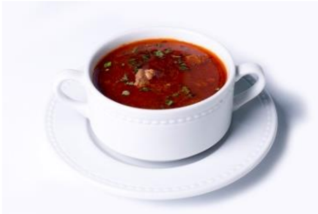
Traditional beef gulash with spicy pepper, if requested