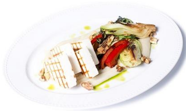
Grilled sheep cheese with grilled vegetables